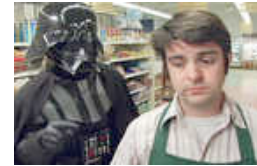
'Chad Vader' (BLAME SOCIETY PRODUCTIONS)